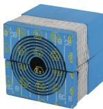
CM BG™ Ex module with Multidiameter™